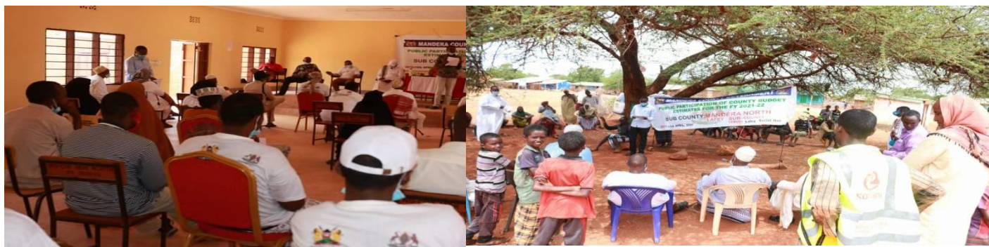
The general public of lafey and Mandera north sharing their needs for the financial year