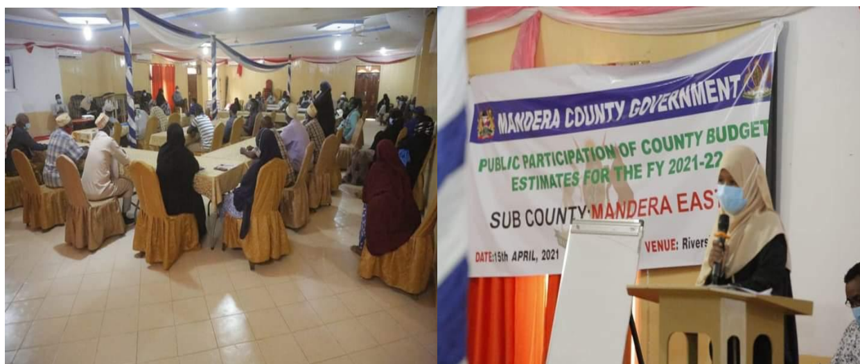
Mandera East residents giving out their views and challenges