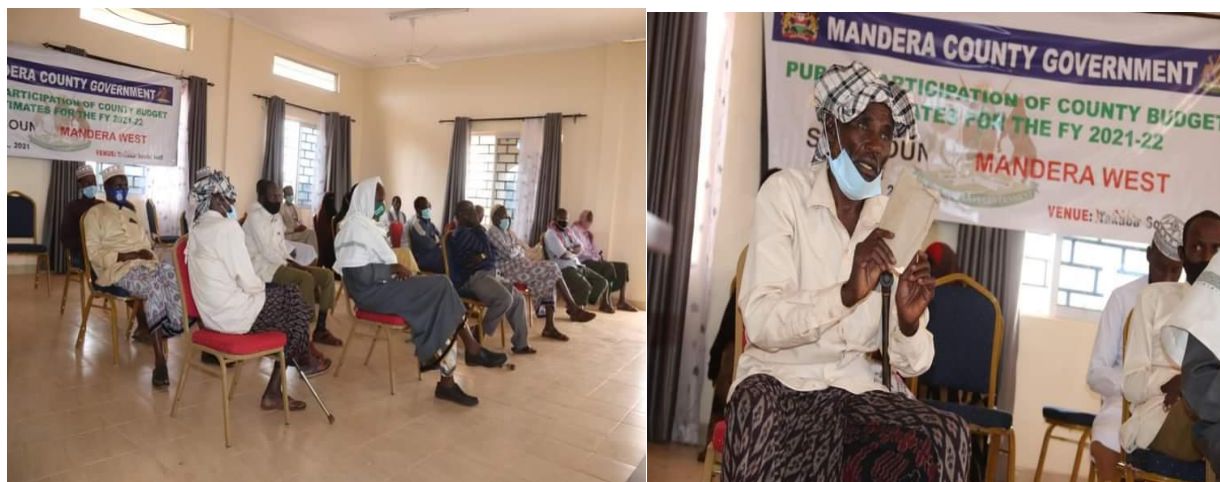
Residents of Mandera west giving out their inputs and views on the budget estimates