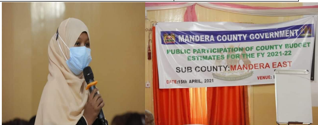
Chief Officer economic planning and statistics officially opening the public participation of budget estimates FY2021/22 activity at riverside in hotel Mandera east.