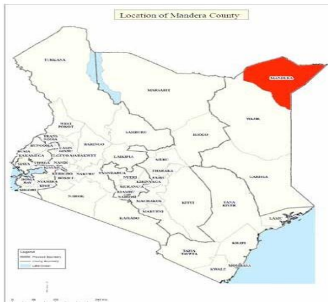
Figure 1: Location of the County in Kenya