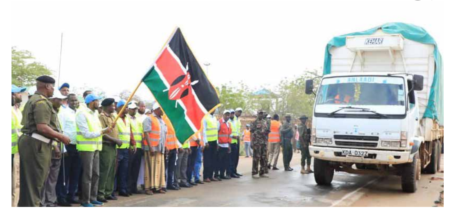
Vulnerable Mapping, Relief food flag off & distribution overnor Khalif flagged off 750 metric tons of foodstuff and 180,000 litres of cooking oil. This intervention will cover about 60,000 Vulnerable House Holds and People living with disability. Other beneficiaries are boarding secondary schools, special needs schools and registered orphanage.