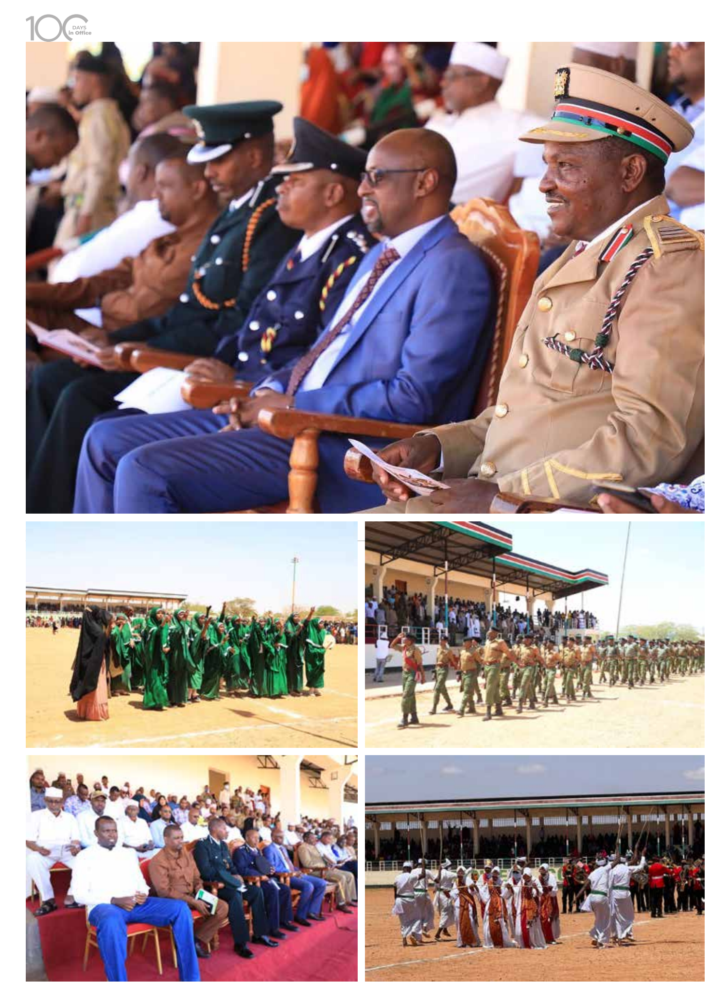
Mashujaa Day Pomp and glamour as Mandera County celebrates 2022 Mashujaa Day