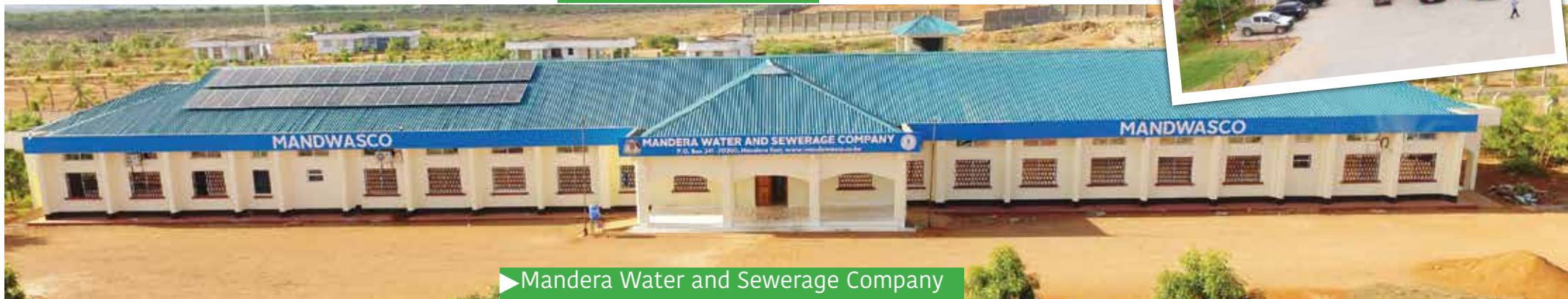
Mandera Water and Sewerage Company