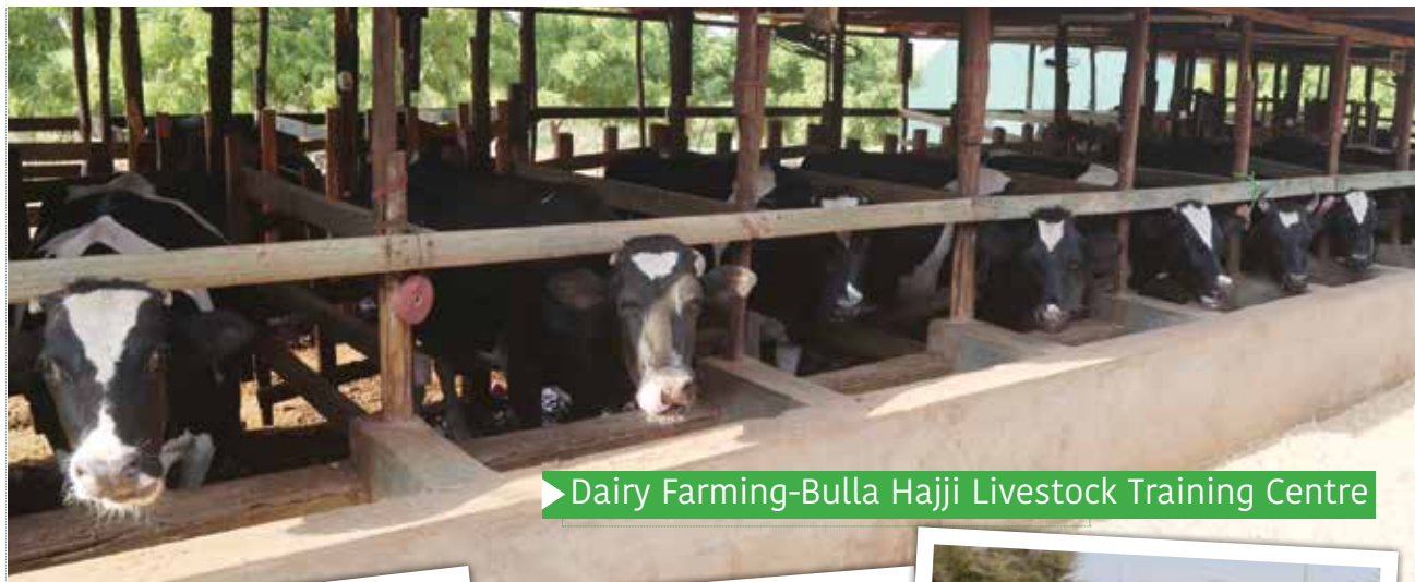
► Dairy Farming-Bulla Hajji Livestock Training Centre