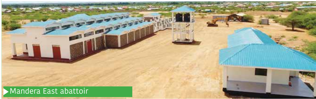
► Mandera East abattoir