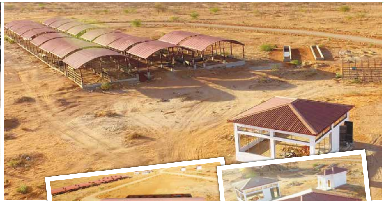
► Mandera Regional Livestock market