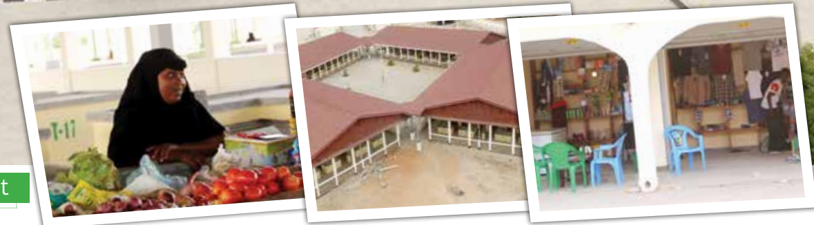
Elwak regional market

Well aware of few employment opportunities in the county, we have built SME markets in Elwak and Mandera Municipality to boost economic incomes for our youth, women and PWDs.