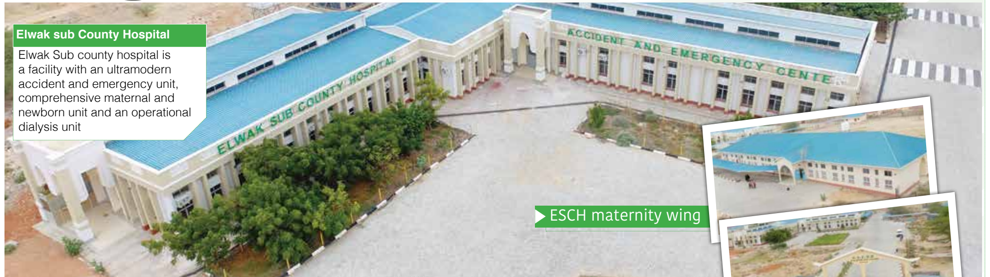
ESCH maternity wing

Elwak Sub county hospital is a facility with an ultramodern accident and emergency unit, comprehensive maternal and newborn unit and an operational dialysis unit