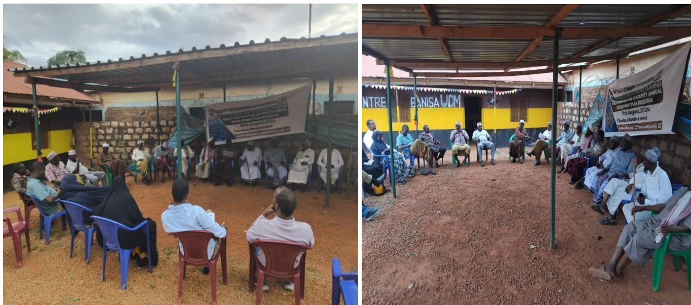
Figure 2: Public participation forum at Banisa