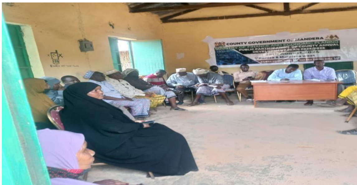
Figure 1: Public participation forum at Takaba, Mandera West