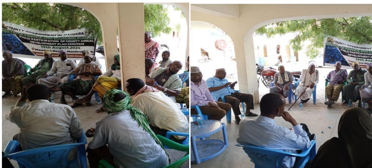
Figure 3: Public participation forum at Elwak, Mandera South