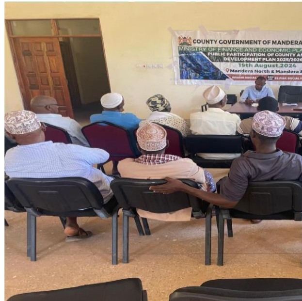
Figure 4: Public participation forum at Rhamo,Mandera North