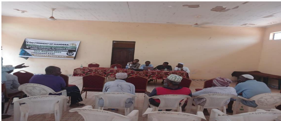
Figure 5: Public Participation Forum at Mandera East