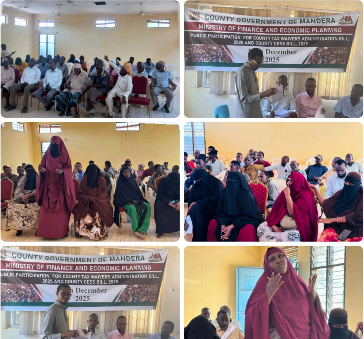
Figure 2: Public giving their views and inputs on Waiver and Cess Bill